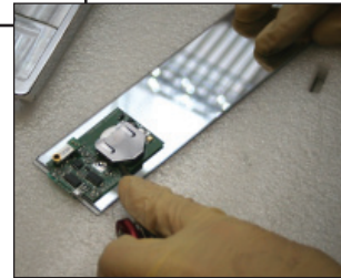
C: Replace Battery

Caution: Use dry, clean hands. Avoid touching circuit board.