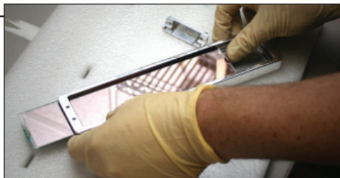
B: Remove cap & slide out mirror.