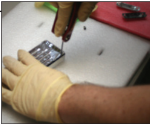
A: Unscrew Cover

Continuously flashing, red LED on mirror indicates low battery.